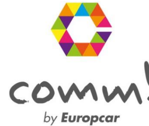
comm! By Europcar